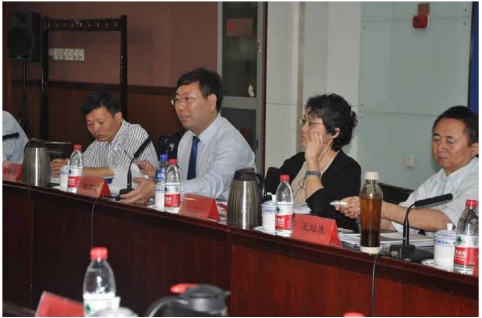
Environmental Justice Roundtable in Beijing