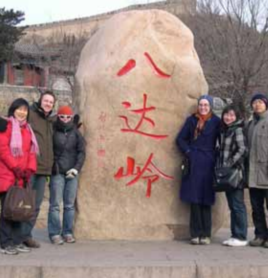
VLS and CUPL students on the Great Wall