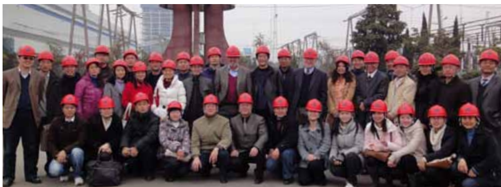
Train-the-Teacher participants on a field trip at an electronic waste recycling plant