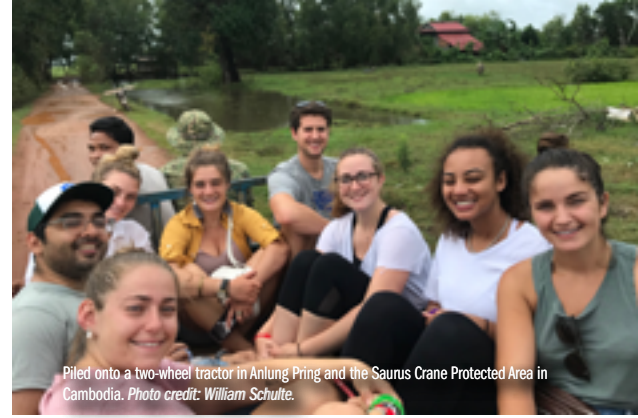
Piled onto a two-wheel tractor in Anlung Pring and the Saurus Crane Protected Area in Cambodia.

Overall, this two-week field study greatly enhanced our learnings from the course on Environmental Governance. It provided experiential and service-learning and brought the importance of good law and policy to life. Although Cambodia and Myanmar have a number of challenges in protecting their environment, civil society in both countries is making great strides in raising international awareness to hold the government accountable.