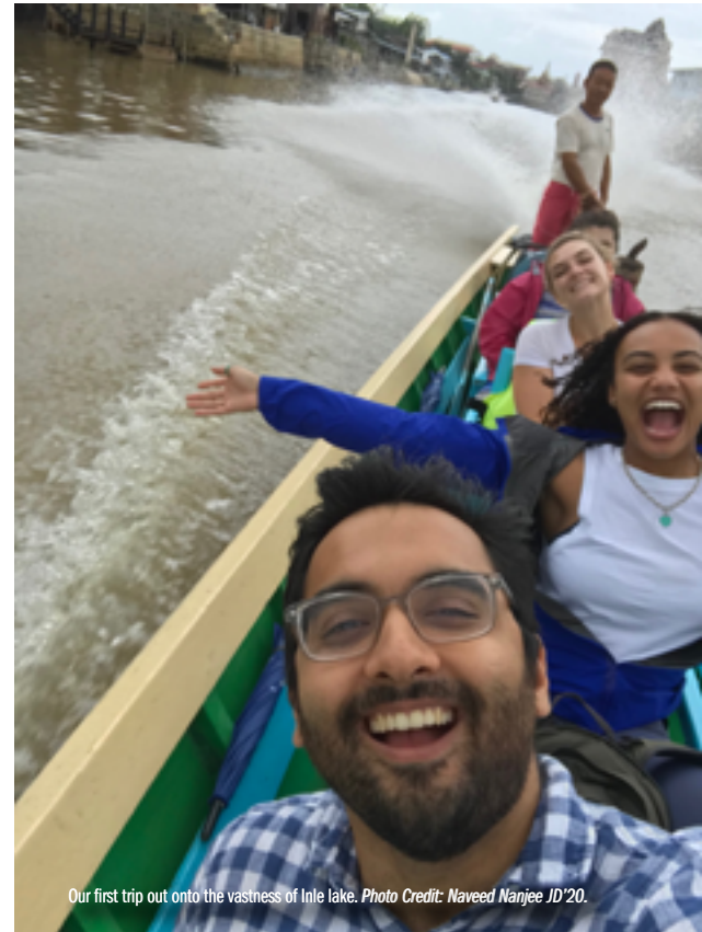
Our first trip out onto the vastness of Inle lake.