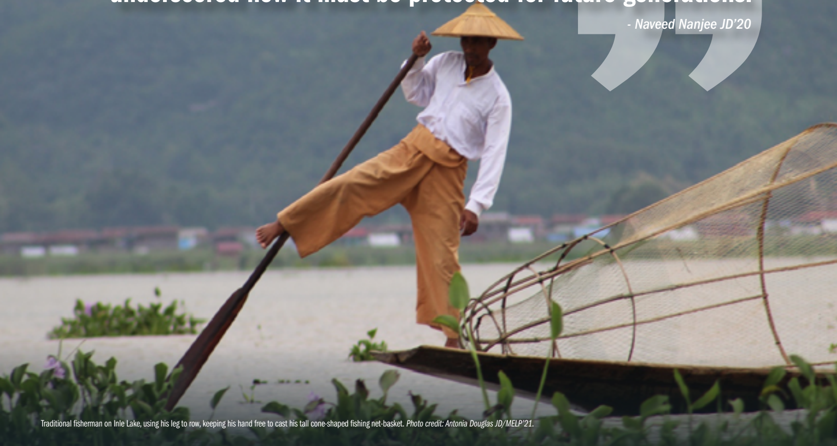
Traditional fisherman on Inle Lake, using his leg to row, keeping his hand free to cast his tall cone-shaped fishing net-basket.