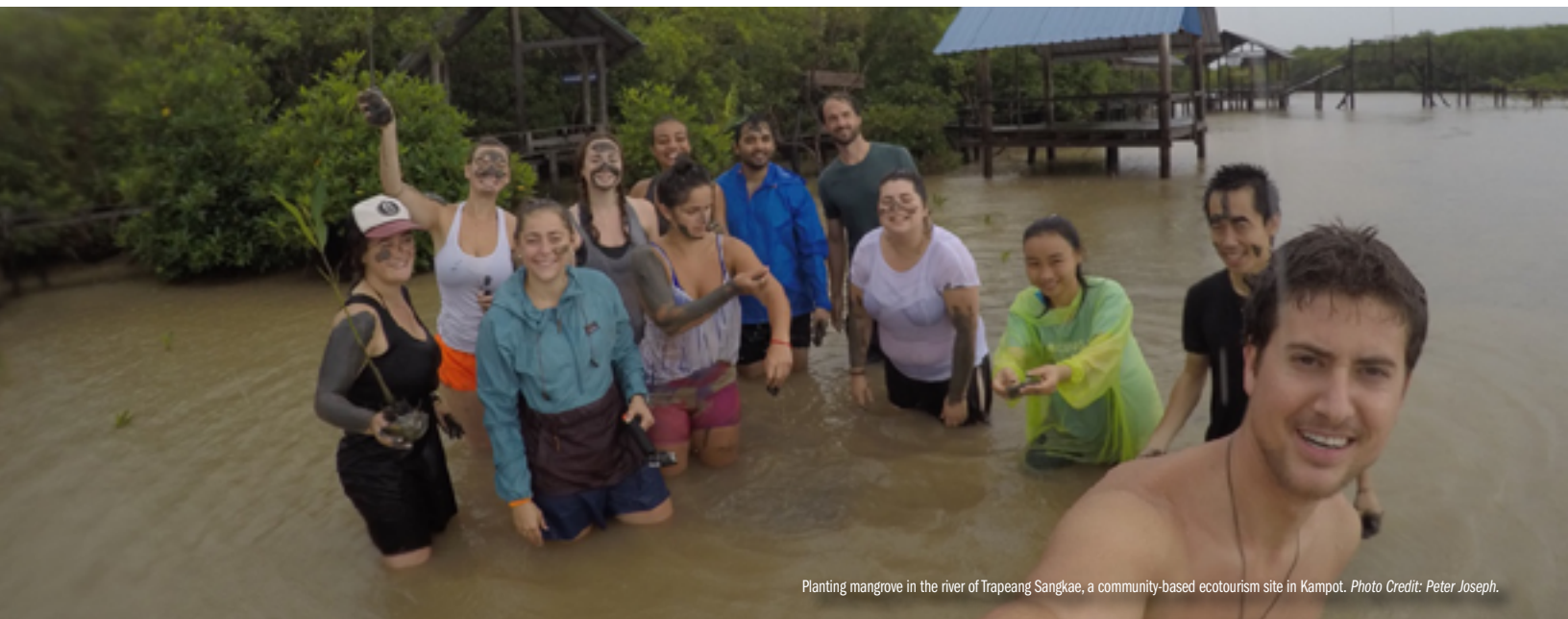
Planting mangrove in the river of Trapeang Sangkae, a community-based ecotourism site in Kampot.