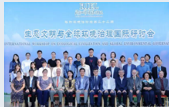
International Workshop on Ecological Civilization and Global Environmental Governance in Haikou, Hainan Province on October 23, 2019.